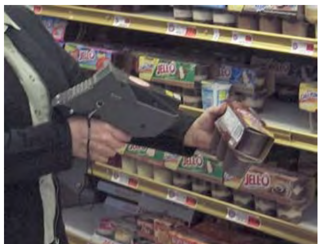
Price accuracy (scanner) inspection