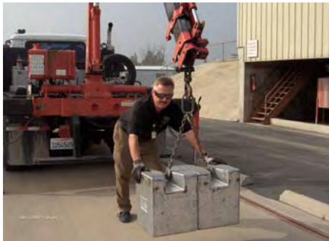
Vehicle Scale Inspection