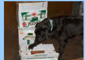
“CC” alerting on an unmarked box of fruit