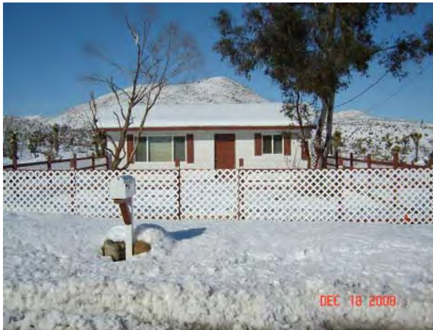
Assisted client to purchase house in Yucca Valley

The department receives grant funding to increase the amount of affordable housing within San Bernardino County. The amount of increase of affordable housing is directly related to multifamily and single family housing that is produced. By using this data as a performance measurement, the department can track the amount of housing that is produced during the year which will assist in developing the department's annual housing plan. By issuing a RFP for multifamily housing projects every year, the department will be able to provide more multifamily housing than it has in recent history.